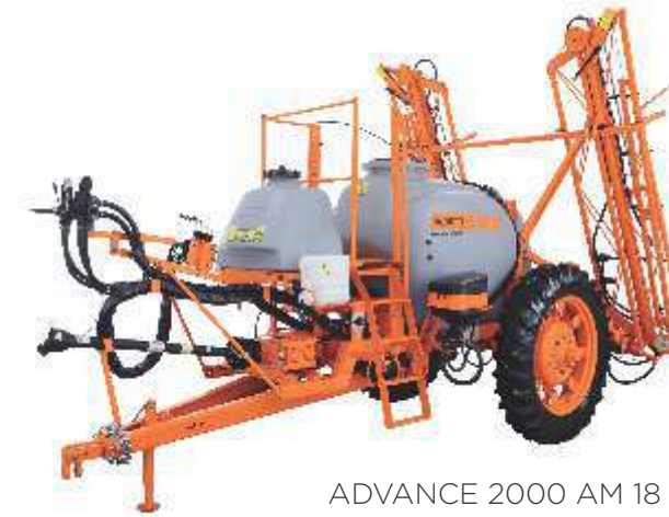
ADVANCE 2000 AM 18

Advance Line was designed to meet the requirements of farmers seeking efficient application and ensured crop protection.