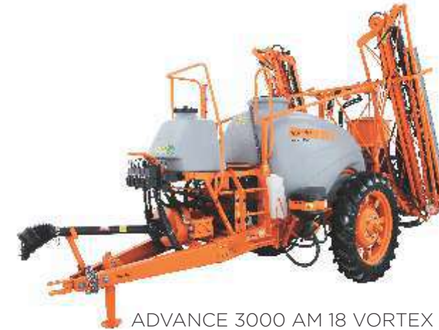
ADVANCE 3000 AM 18 VORTEX