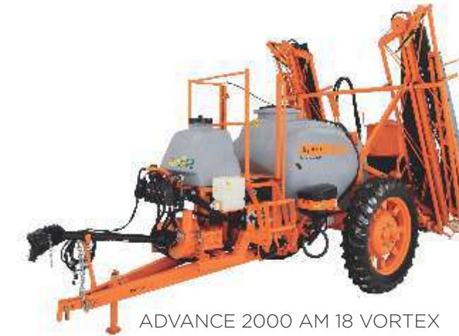
ADVANCE 2000 AM 18 VORTEX