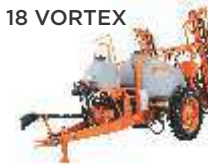
ADVANCE 3000 AM 18 VORTEX