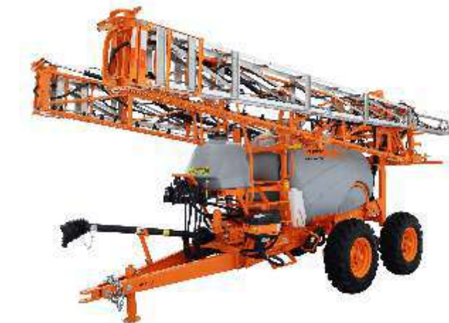
ADVANCE 3000 TANDEN ARROZ