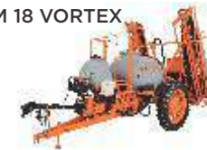
ADVANCE 2000 AM 18 VORTEX