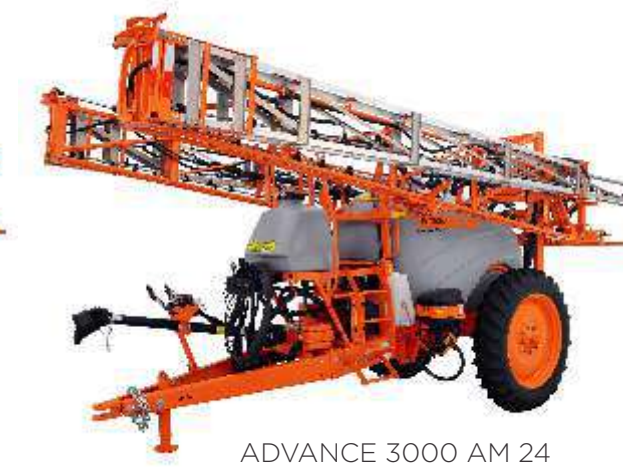
ADVANCE 3000 AM 24