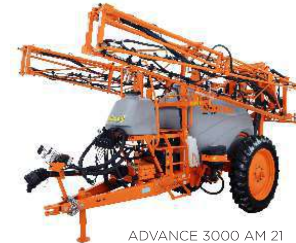
ADVANCE 3000 AM 21