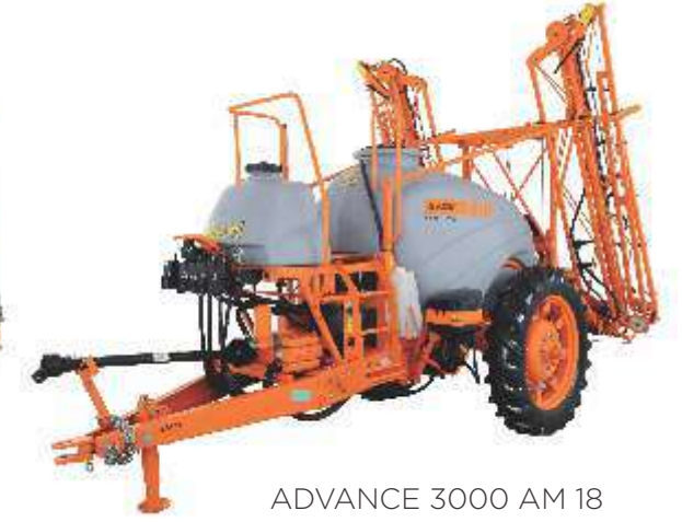
ADVANCE 3000 AM 18