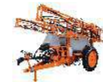
ADVANCE 3000 AM 24